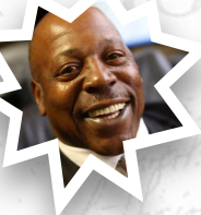
Vinnie Johnson Co-Chair Founder & Chairman, Piston Group