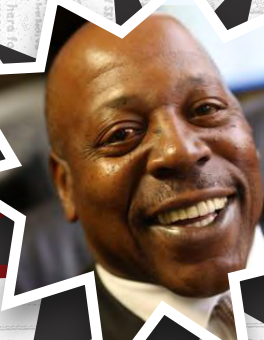
Vinnie Johnson Piston Group