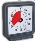
(Time Timer® visual timer)

The rail cars have open sides and I have to keep my hands, feet, and body INSIDE the car and stay in my seat...this will keep me safe when the train is moving. I will be very excited on the train, but have to remember to not shout near other people—it might hurt their ears.